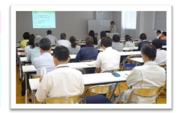
Learning about cultural differences.