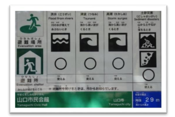
Easy-to-understand disaster-prevention information.