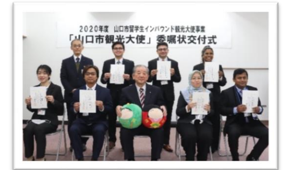
Foreign students being appointed as "Yamaguchi Tourism Ambassadors"