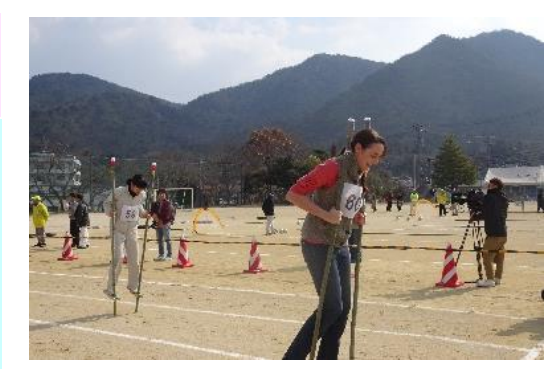
Foreign citizens taking part in local events.