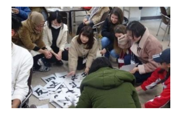
Engaging in exchange activities with foreign students in Yamaguchi.